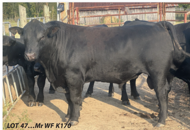
LOT 47...Mr WF K170