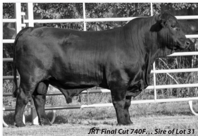
JRT Final Cut 740F... Sire of Lot 31