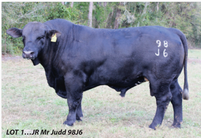
LOT 1...JR Mr Judd 98J6