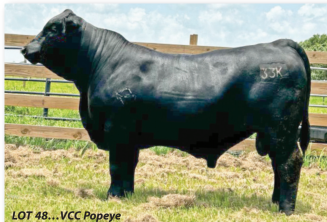
LOT 48...VCC Popeye