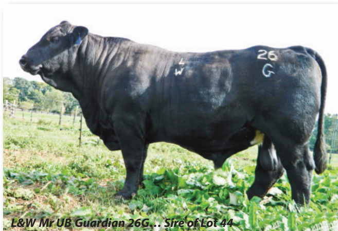
L&W Mr UB Guardian 26G... Sire of Lot 44

A low birth weight heifer bull with high Milk and TM. This is the kind of bull you need to produce replacement heifers to keep.