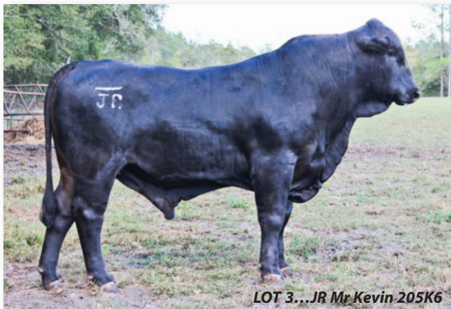
LOT 3...JR Mr Kevin 205K6

Long, clean, and well-balanced with a good set of EPDs.