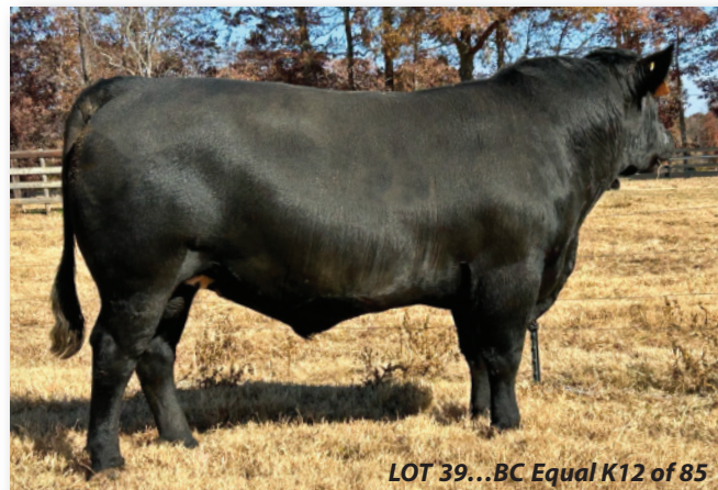
LOT 39...BC Equal K12 of 85

Low birth weight, high performance and easy keeping. This Angus bull has a moderate frame with lots of muscle, a thick top and a big rump.