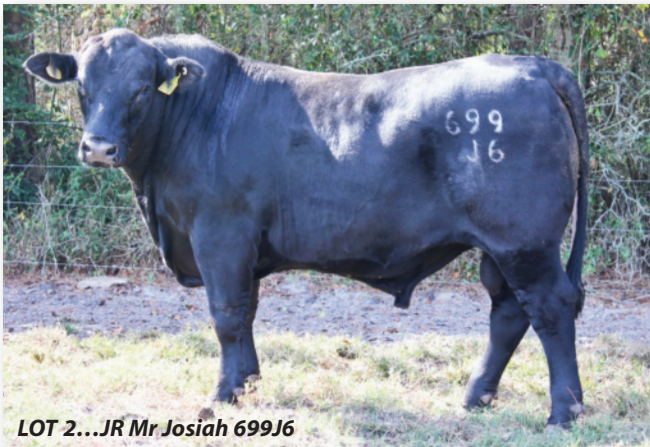
LOT 2...JR Mr Josiah 699J6

A well-muscled and long bull with a deep spring of rib.