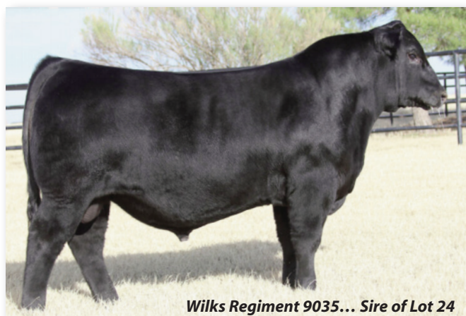
Wilks Regiment 9035... Sire of Lot 24

Deep-sided, long made with a good set of growth EPDs, lots of milk and top 15% IMF.