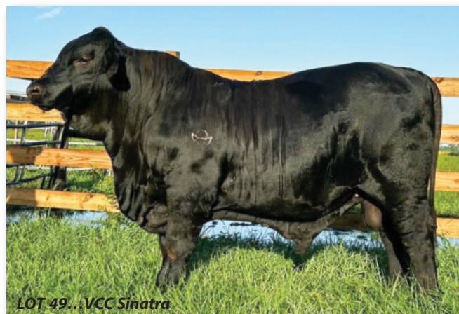
LOT 49...VCC Sinatra