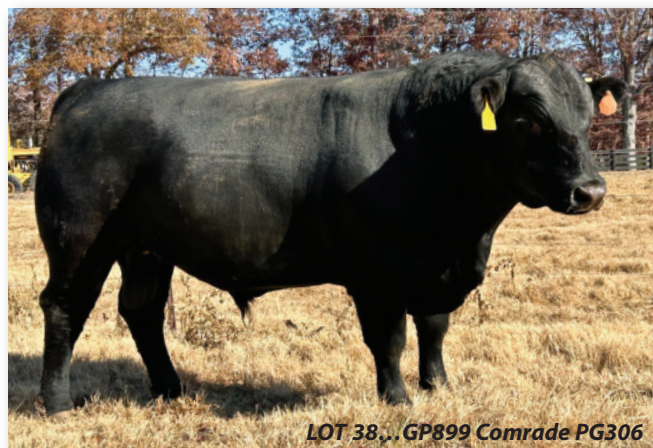
LOT 38...GP899 Comrade PG306

A calving easy bull with low birth weight and high performance. He's easy-keeping with a moderate frame and lots of muscle. Very gentle - for good Angus bulls don't overlook these two. Full 2-year-old.