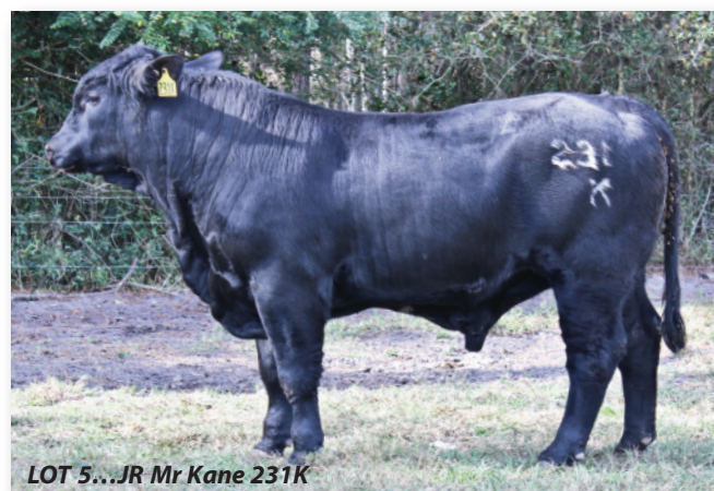
LOT 5...JR Mr Kane 231K

A very nice 18-month-old with lots of potential.