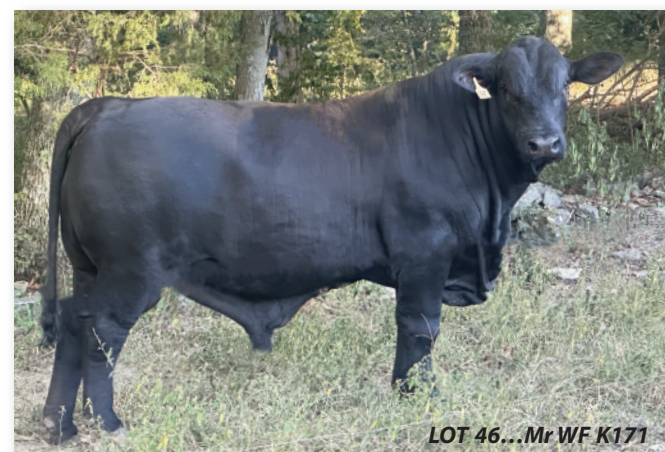
LOT 46...Mr WF K171