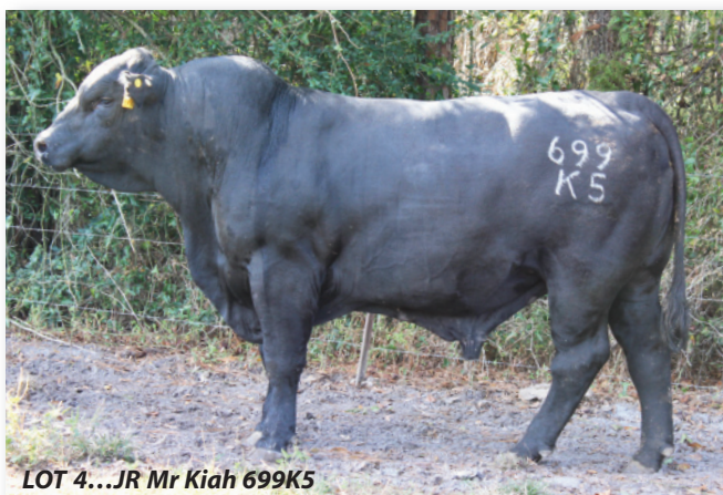
LOT 4...JR Mr Kiah 699K5

Well-made, long spine and a clean sheath.