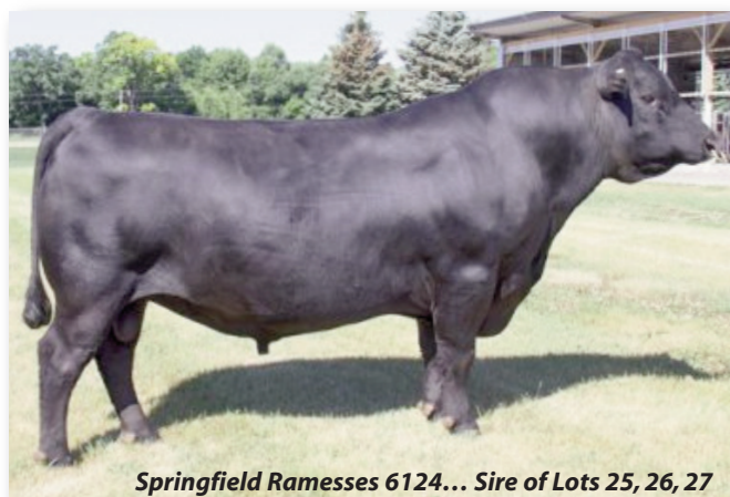
Springfield Rameses 6124... Sire of Lots 25, 26, 27

This AI (Rameses) Ultrablack bull has well-balanced EPDs for growth and carcass and is in the top 10% of IMF.