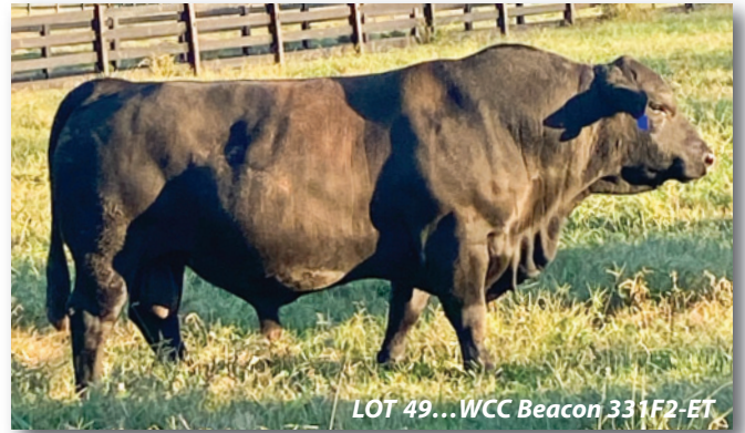
LOT 49...WCC Beacon 331F2-ET

This bull is an embryo calf. His sire is one of the most used Brangus bulls in the breed. His dam is out of the breed-wide popular 331-cow family. I have used him and weaned my first calves with no creep feed weighing in at 610 pounds at 205 days. I will be calving another set of cows in January. I have not had to pull the first calf from this bull. He needs to go back to a purebred herd. Very, very gentle.