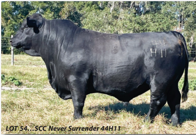
LOT 54...SCC Never Surrender 44H11