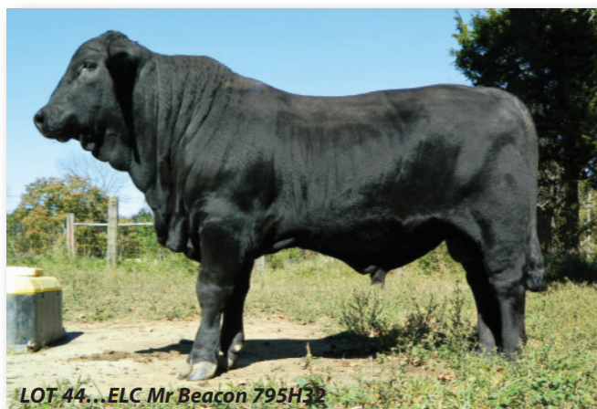
LOT 44... ELC Mr Beacon 795H32

Deep-sided, clean with a great set of EPDs. This is a second generation Brangus that will bring new blood to any herd. In top 30% of breed for WW and YW.