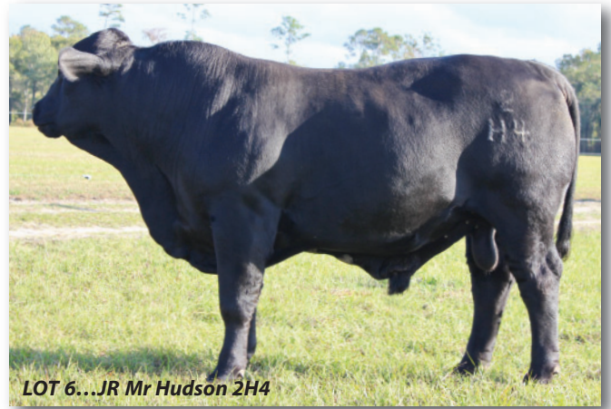
LOT 6...JR Mr Hudson 2H4

A minus 1.2 BW EPD as well as balanced EPDs throughout. Thick, nice spring of rib and bone.