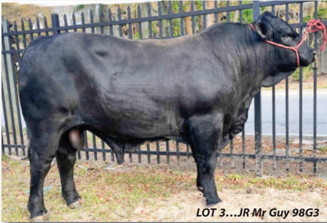
LOT 3...JR Mr Guy 98G3

A grandson of Brinks Robertson. Dam is by CNF On Line. Good disposition, thick-bodied with good muscling and long-sided.