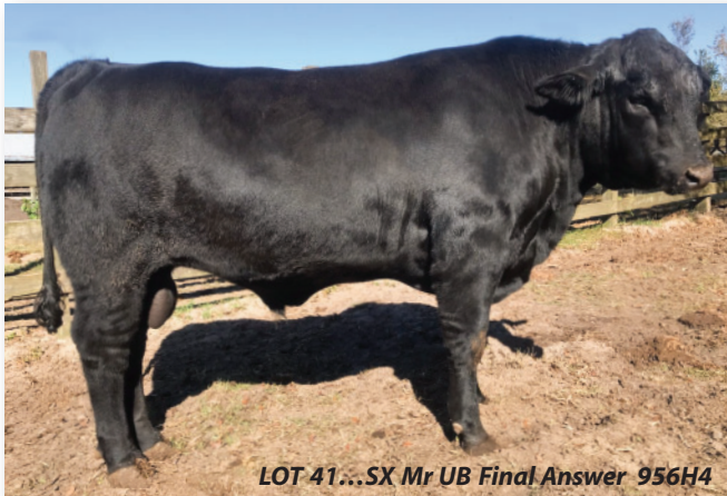
LOT 41...SX Mr UB Final Answer 956H4