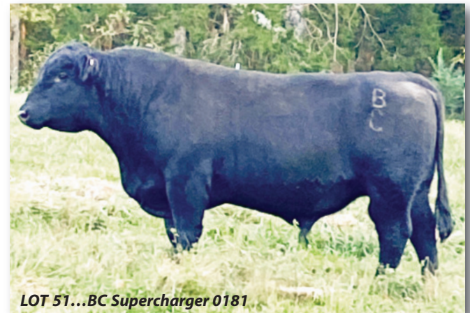
LOT 51...BC Supercharger 0181

Another big stout, AI bull with lots of meat and muscle. He is good enough to go into a purebred herd. Very gentle and will be over 25 months old on sale day.