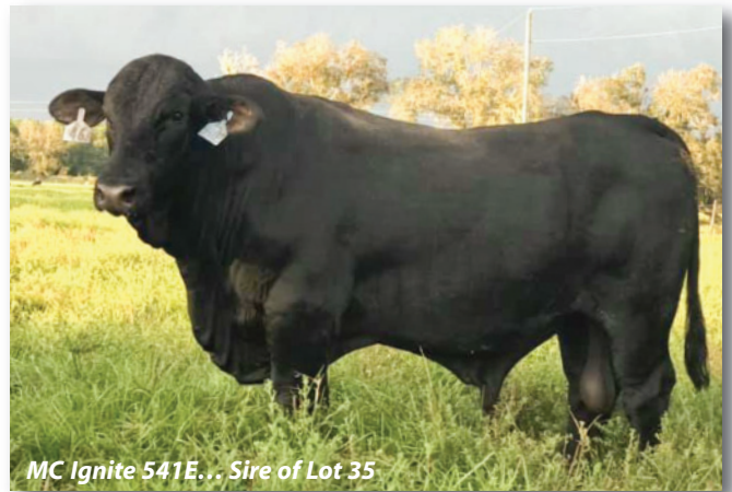
MC Ignite 541E... Sire of Lot 35

Nice young Ultrablack son of MC Ignite 541E. Outstanding EPDs, 10 traits in the top 35% including top 3% REA, top 5% YW and top 10% WW.