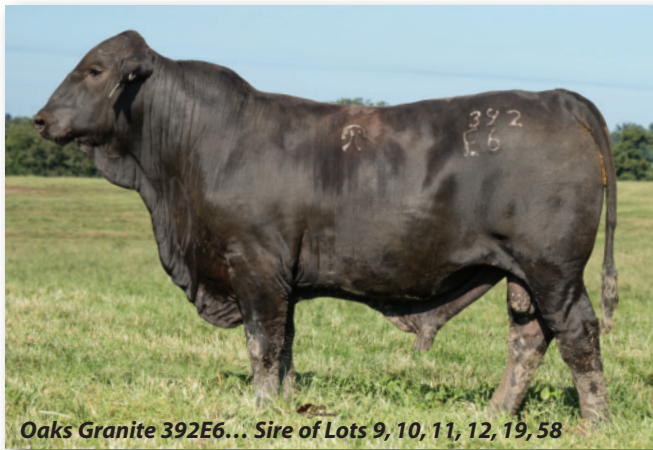
Oaks Granite 392E6... Sire of Lots 9, 10, 11, 12, 19, 58