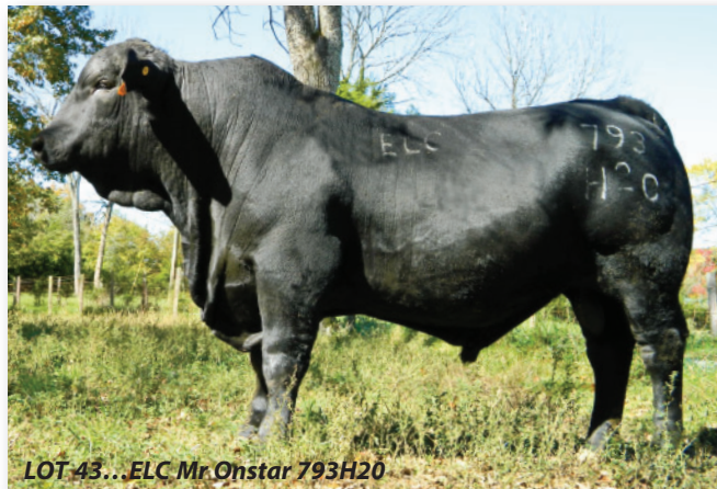
LOT 43... ELC Mr Onstar 793H20

Sired by 331A43 Suhn's Onstar. He is long and stout with excellent set of EPDs. He ranks in the top 20% of breed for WW, YW, TM and REA.