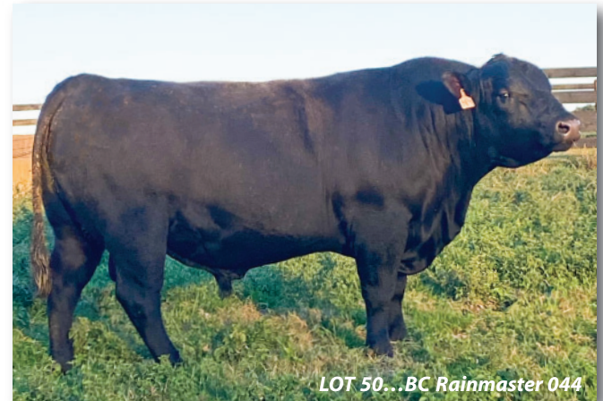
LOT 50...BC Rainmaster 044

A big stout, AI sired bull with a lot of meat and muscle. This bull will be right at 28-months-old on sale day. He can cover lots of cows and has a great disposition.