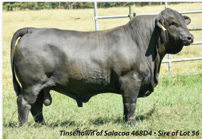
Tinseltown of Salacoa 468D4 • Sire of Lot 56