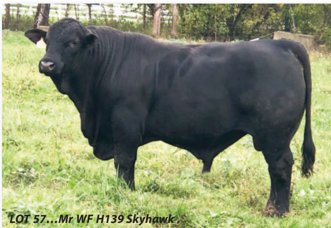
LOT 57...Mr WF H139 Skyhawk