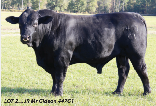
LOT 2...JR Mr Gideon 447G1

A grandson of Brinks Robertson. Dam is sired by Uppercut of Brinks. Well-balanced, long-bodied and a good temperament.