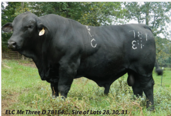
ELC Mr Three D 781E4... Sire of Lots 28, 30, 31

A Three D grandson with nine EPDs in the top 35% leading with 4% WW and 10% YW and Fat. Two-year-old bull ready to go to work. Very nice looking bull.