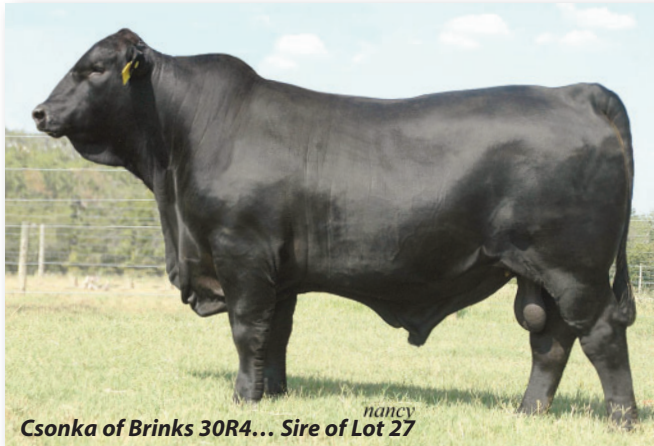
Csonka of Brinks 30R4... Sire of Lot 27

This Bear grandson has good growth and maternal numbers. He is moderate and thick with lots of bone and a quiet disposition.