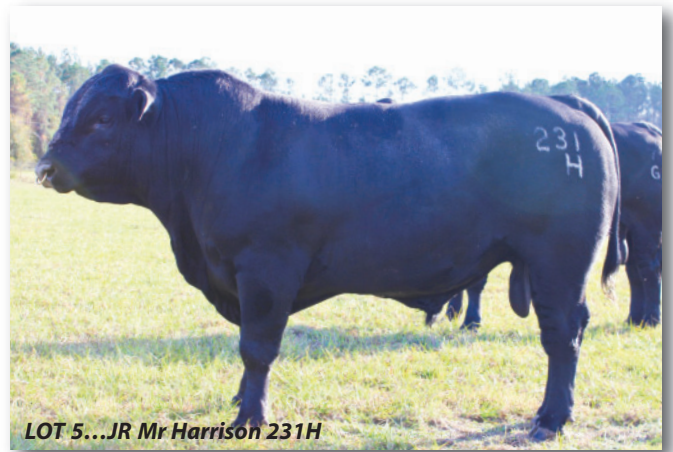
LOT 5...JR Mr Harrison 231H

A clean underlined bull with a light BW EPD. Should be ok for heifers.