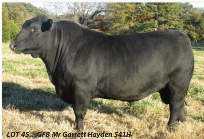
LOT 45... GFB Mr Garrett Hayden 541H

This 23-month-old AI son of Garrett of Brinks 789P has five EPD traits in top 10% of breed and four in top 20%. He will work on heifers and add growth to the herd. He needs to be in your pasture!