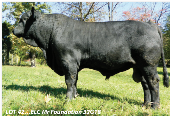
LOT 42... ELC Mr Foundation 32G18

Sired by 331Z28 Suhn's Foundation. Lots of growth in this stout, clean bull with lots of muscle and bone. In top 10% of breed for WW and YW. He will add pounds to your weaned calves.