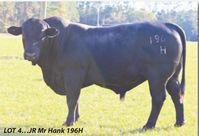
LOT 4...JR Mr Hank 196H

A grandson of Brinks Robertson and the dam is sired by CNF On Line. Good disposition, good muscling and deep-sided.